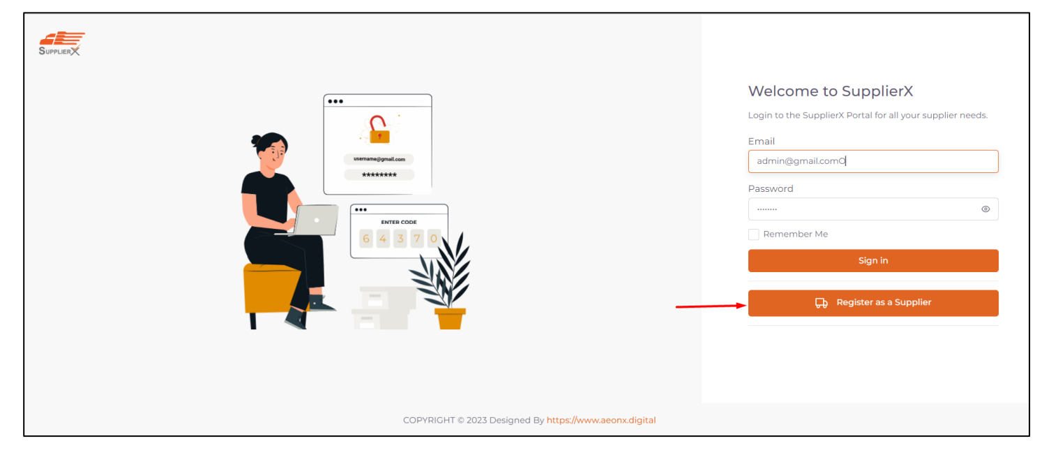
Step 2 \rightarrow Enter email address in the pop-up box.